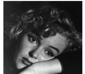
André de Dienes Marilyn Monroe (A Study in Sadness) , c. 1955