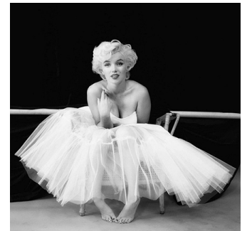
Milton Greene Marilyn Monroe, Ballerina Sitting, 1954