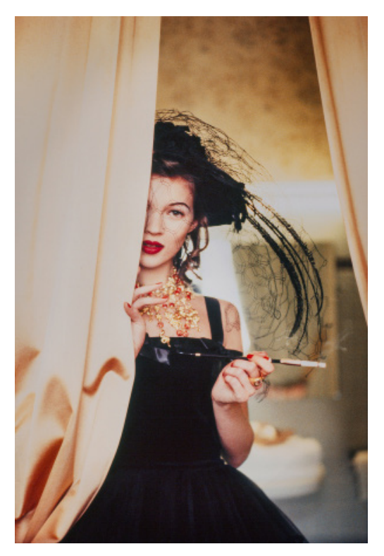
Kate Moss #6, Italian VOGUE, 1992