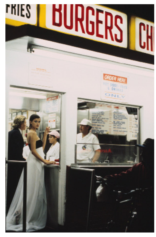
Hot Dog Stand II: Trish Goff, Los Angeles, VOGUE, 1993