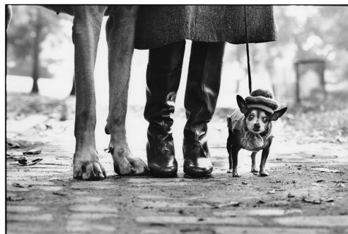
New York City (Dog Legs), 1974