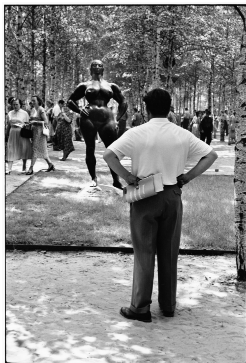
Gorky Park, Moscow, 1959