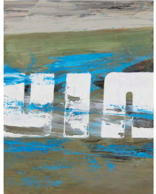
Blunderbust S-130, 2023 Acrylic and oil on aluminum 11x8.5 inches / 27x21 cm