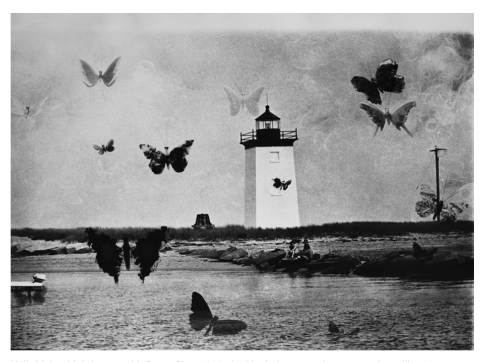
Kali, Maine Lighthouse with Butterflies, 1969. Archival pigment print mounted on dibond. Estate of the Artist.