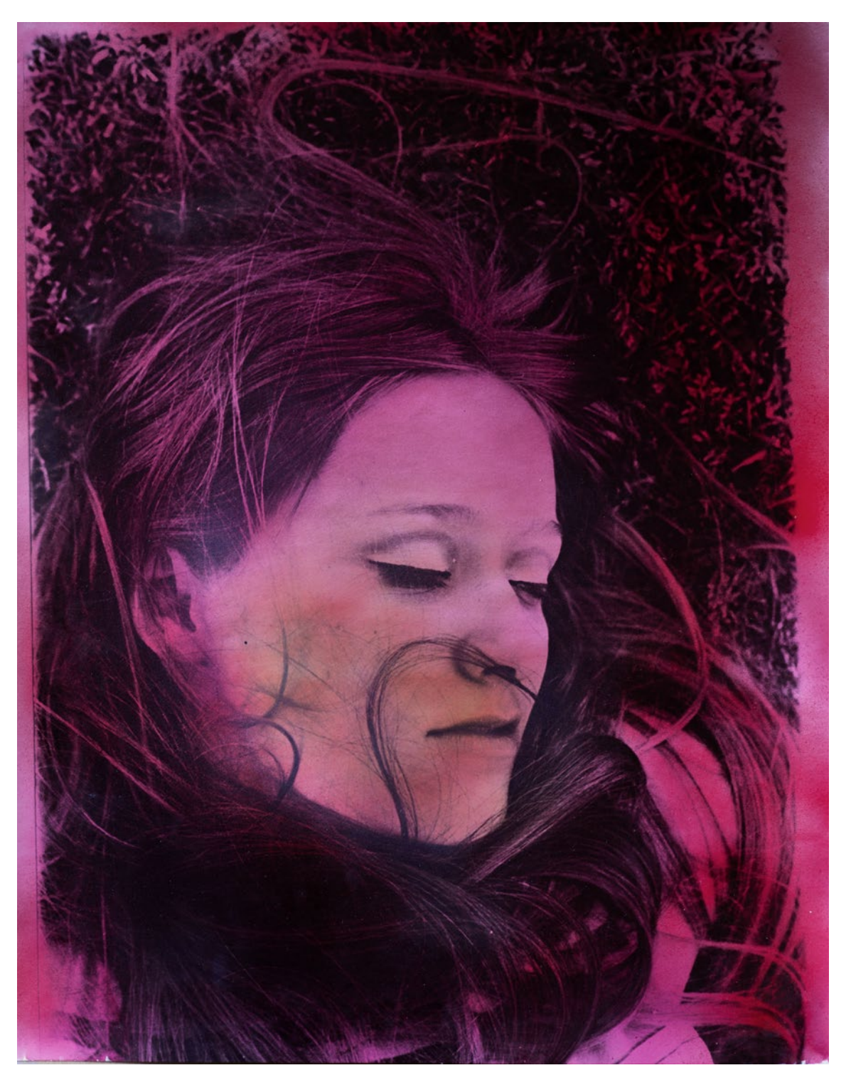
Kali, Pink Sleeping Beauty, Palm Springs, CA 1969. Vintage hand colored gelatin silver print. Estate of the Artist.