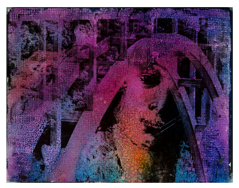
Kali, Botticelli/Bridge. Archival pigment print mounted on dibond. Estate of the Artist.